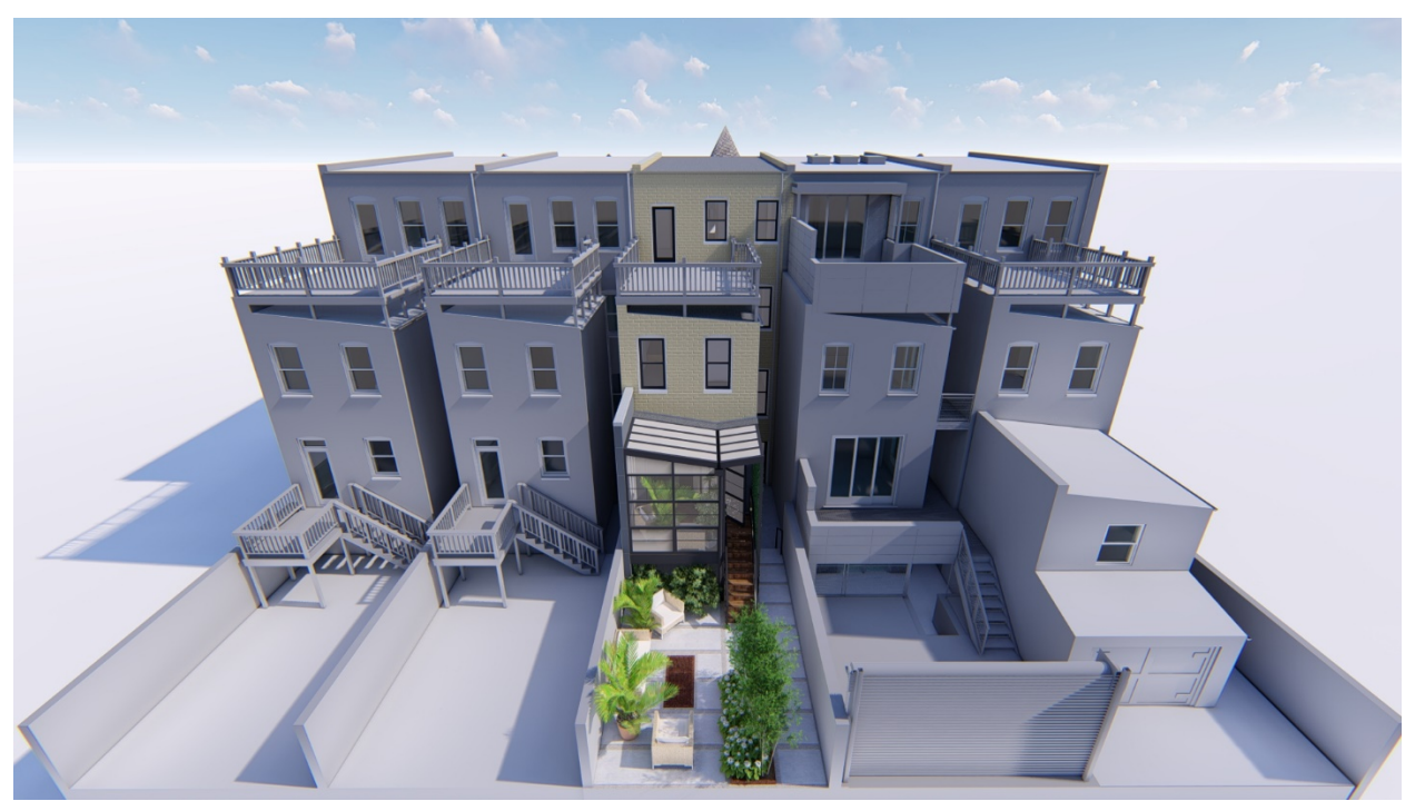
June 21st, 10 AM