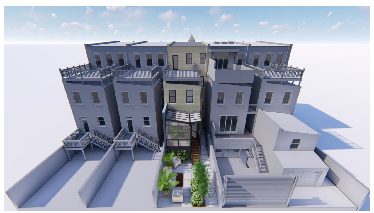
June 21st, 5 PM