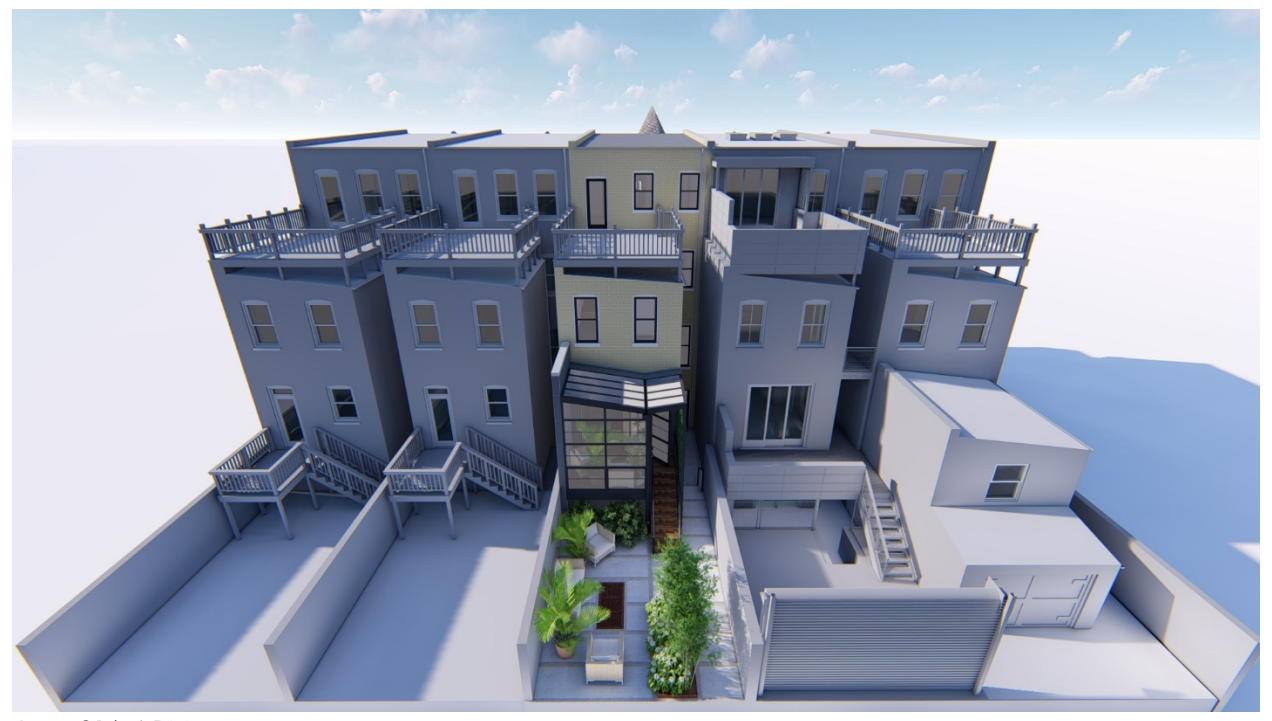
June 21st, 6 PM