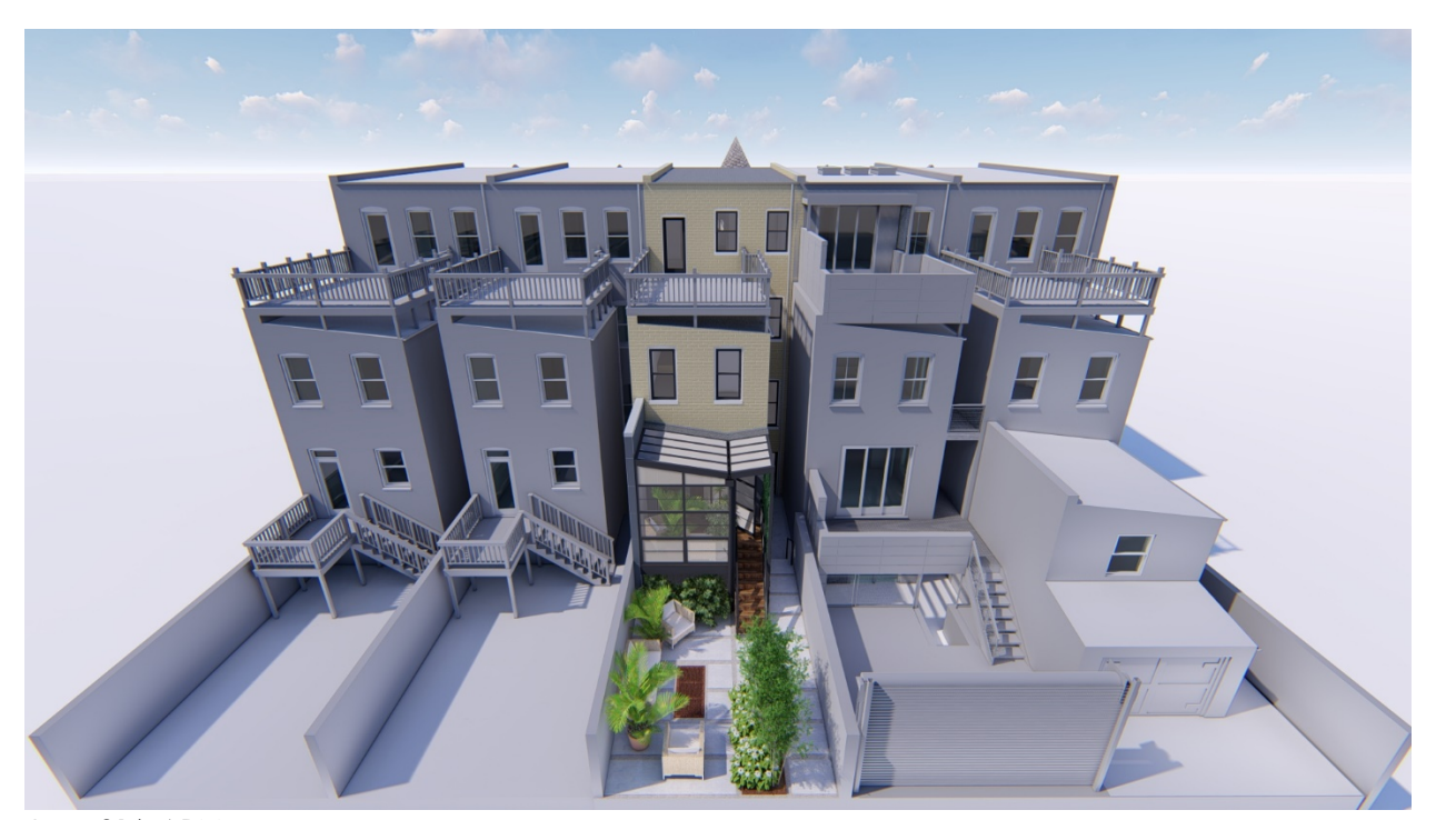
June 21st, 4 PM