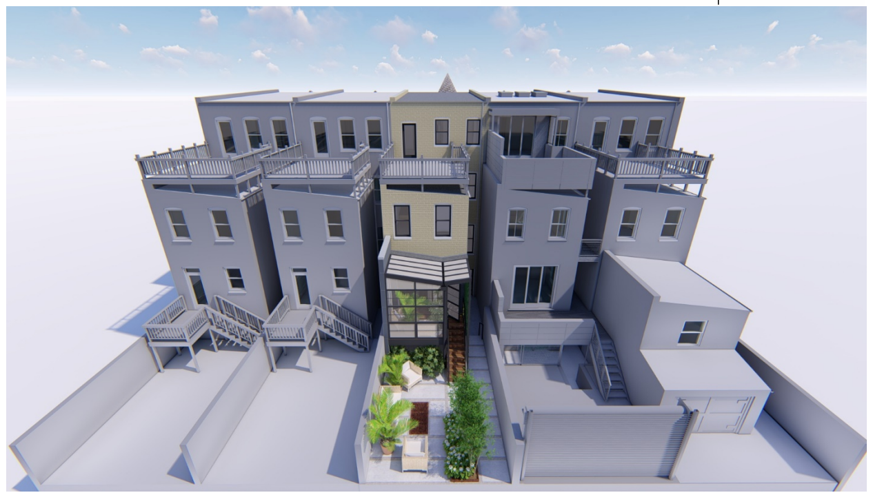
June 21st, 11 AM