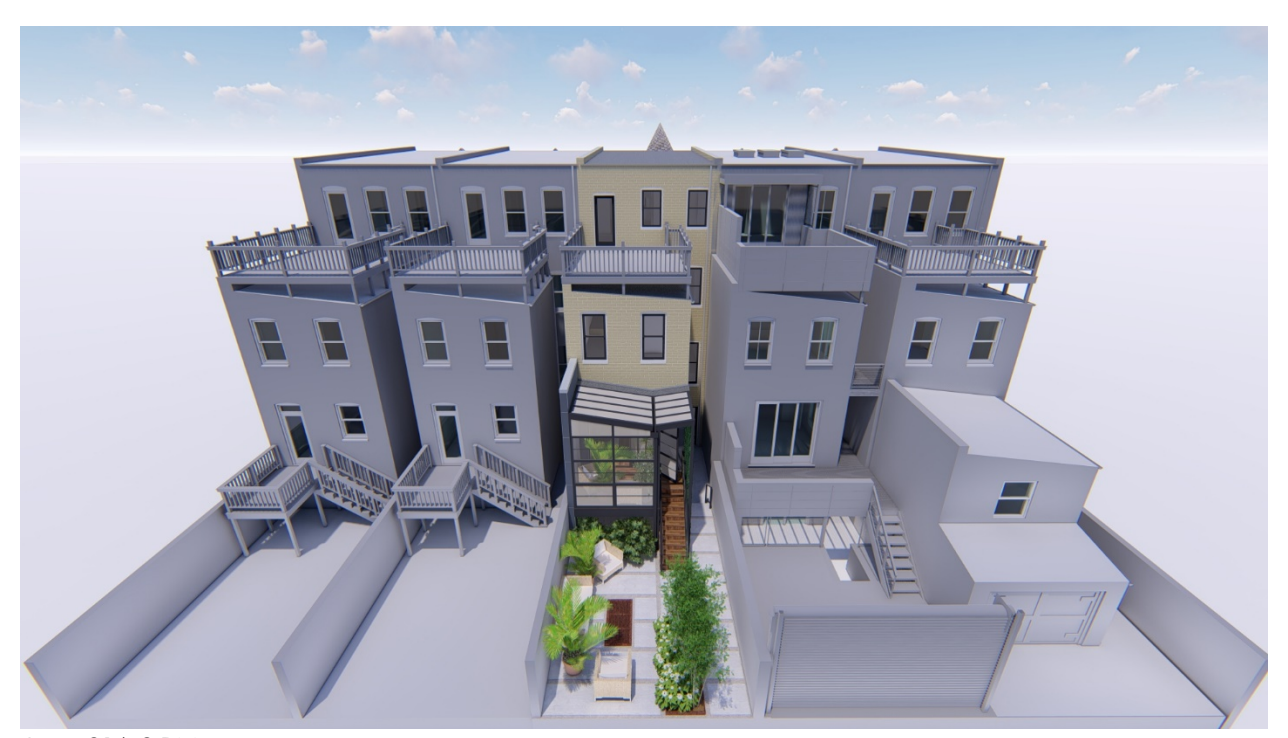
June 21st, 2 PM