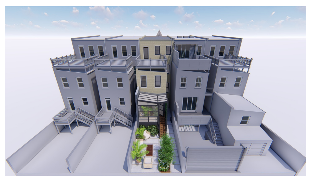
June 21st, 12 PM