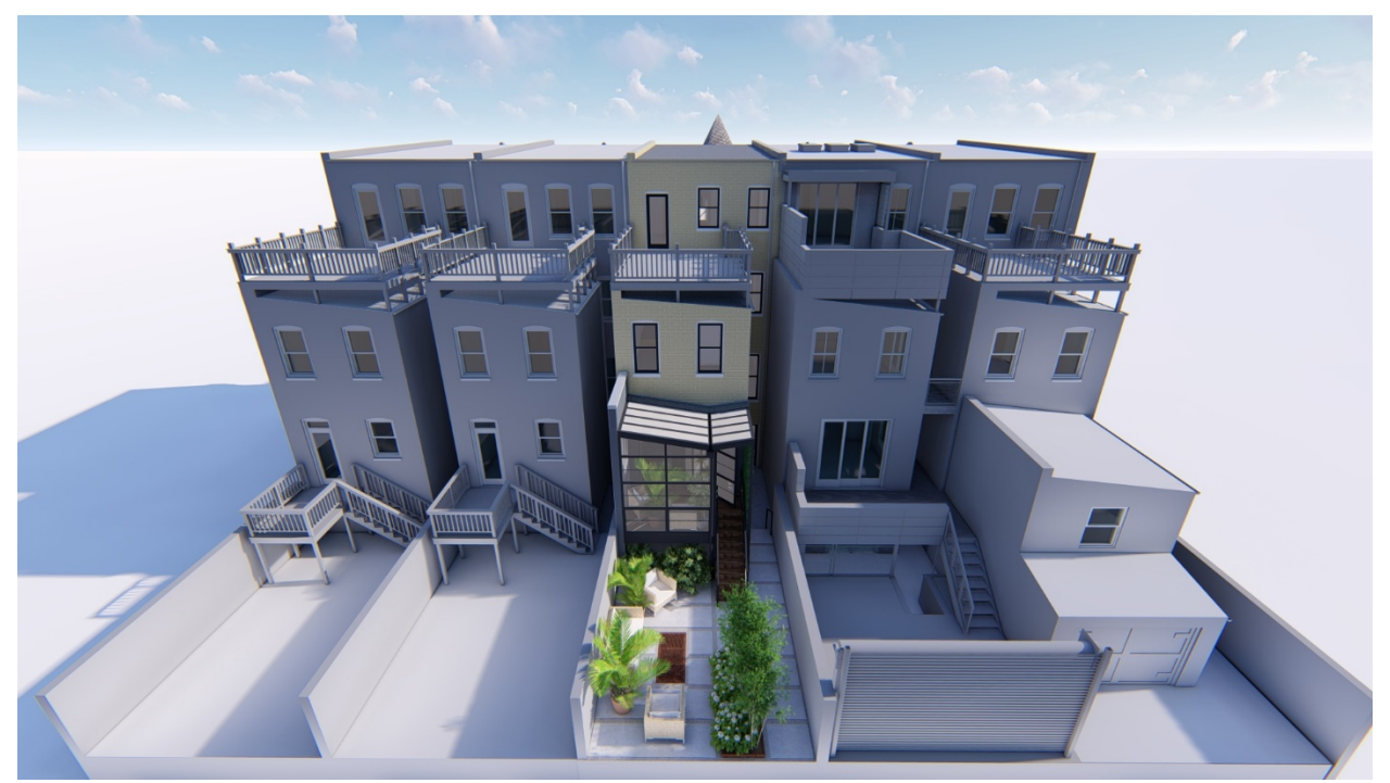
June 21st, 9 AM