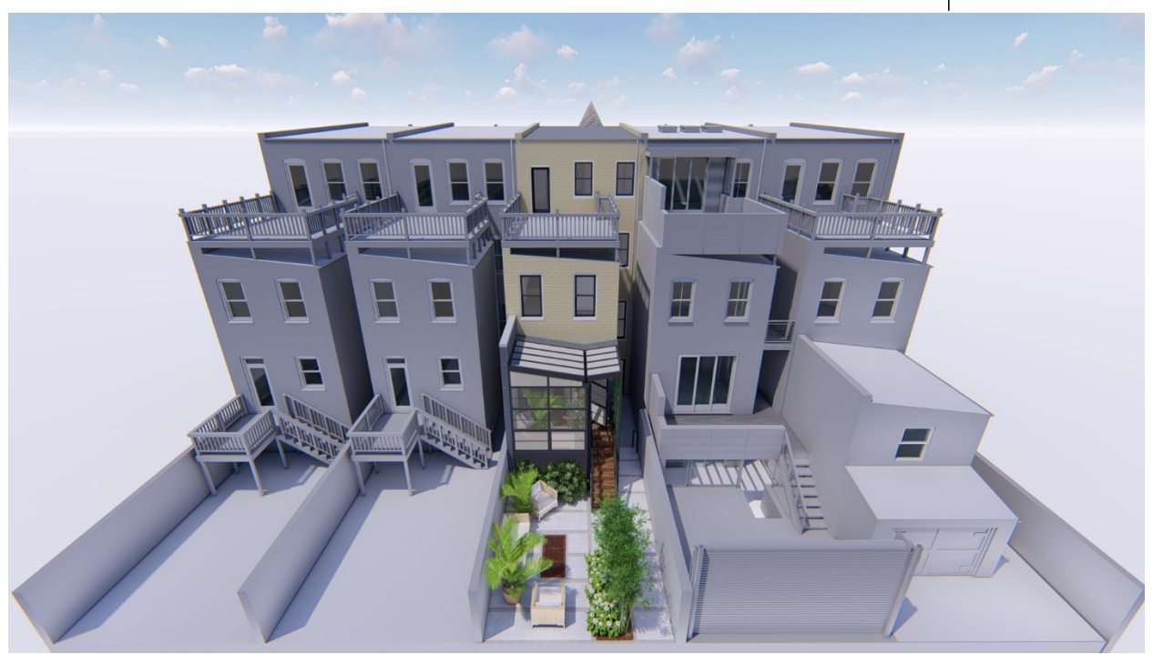
June 21st, 3 PM